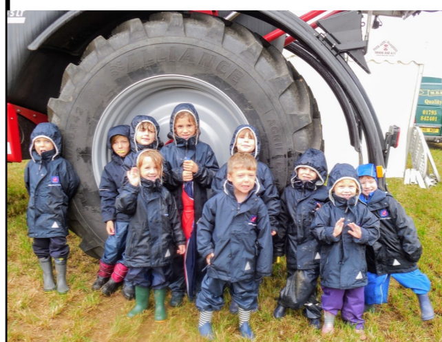
Some of pre-prep on a trip to the East Kent Ploughing match